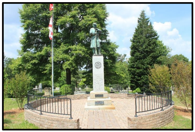
Confederate Monument - Green Hill Cemetery Prior to 3 Jul 2020