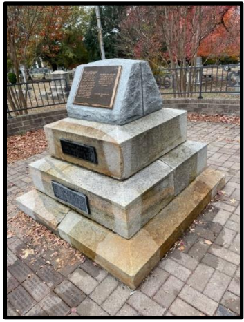
Memorial Marker - Green Hill Cemetery Installed Fall 2023